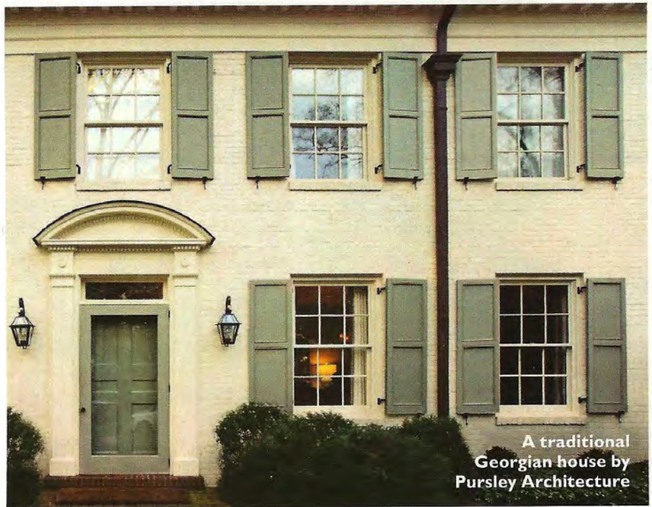
A traditional Georgian house by Pursley Architecture

TRIM Outside White (CW712); prattandlambert.com