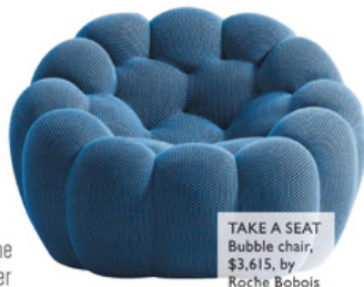
TAKE A SEAT Bubble chair, $3,615, by Roche Bobois

When asked where to find the best modern furniture, our discerning readers had no trouble selecting three showrooms perfect for making a statement. Not only do they each offer some of the world's most innovative designs, but they also offer consultation services.