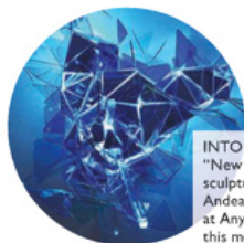
INTO THE BLUE "New Blue" light sculpture Adela Andea, who shows at Anya Tish Gallery this month

We asked, you replied. According to our loyal readers, these are three of Houston's top independent art galleries.