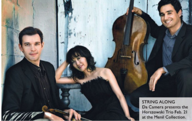
STRING ALONG Da Camera presents the Horszowski Trio Feb. 21 at the Menil Collection.