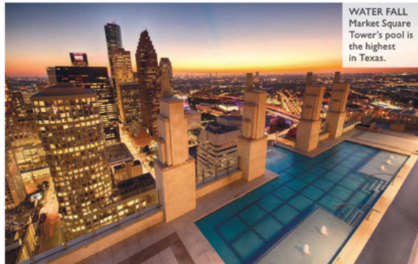
WATER FALL Market Square Tower's pool is the highest in Texas.

3 Roche Bobois Here's another Italian name globally known for cutting-edge design. The San Felipe showroom attracts major mod fans, and nothing is quite as timelessly boho-chic as their Mahjong sectional sofa, which comes in a variety of designs. roche-bobois.com