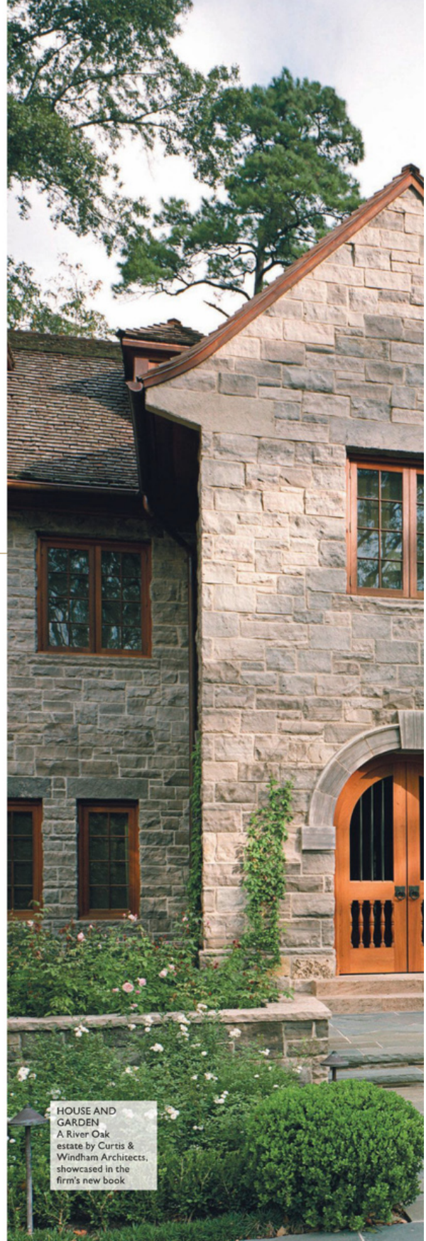
HOUSE AND GARDEN A River Oak estate by Curtis & Windham Architects, showcased in the firm's new book

The sky's the limit for many of the luxury high-rises popping up across town, and three in the city's center are changing the main skyline. The Theater District's dramatic Market Square Tower (777 Preston St., marketsquaretower.com ) has opened for residents. It's Downtown's tallest residential tower, coming in at 40 floors, and amenities include a movie theater, a grand ballroom and a 24-hour concierge service. Most impressive of all is the rooftop pool, which is the highest in Texas and features a glass-bottom section jutting out over the street below. Talk about a view! Also rising in the area is Hines' 32-story Aris Market Square (409 Travis St., hines.com ) on the busy corner of Travis and Preston. It finishes this year, boasting approximately 9,000 square feet of street-level retail and restaurant space. And over by Minute Maid Park, the 28-story Catalyst Houston (1423 Texas Ave.), designed by Ziegler Cooper Architects, also finishes in 2017. It's slated to have 20,000 square feet of outdoor space including a resort-style pool; a rooftop terrace garden; a sundeck with fire pit; a yoga lawn; a volleyball court; and Ballpark Club, where residents can watch Astros home games.